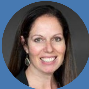
Commissioner Darcie L. Houck