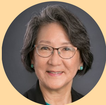
Commissioner Genevieve Shiroma