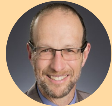
Commissioner Clifford Rechtschaffen