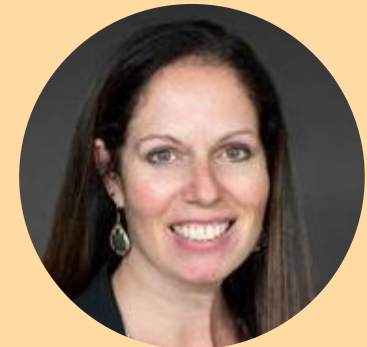
Commissioner Darcie L. Houck