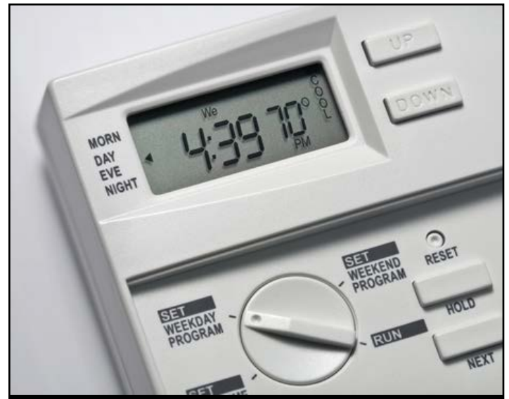
Featured Applications: A.17-12-011 et al

“In order for it to be a success, the utilities have to be operation-