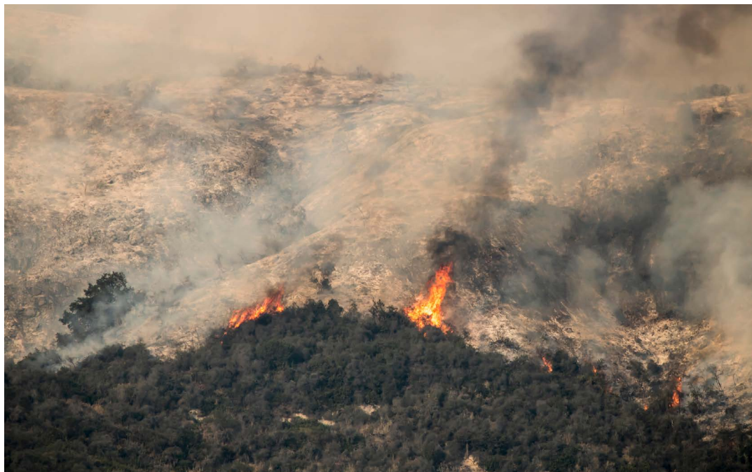
Flames burn the hills during California's 2017 Thomas Fire that affected Ventura and Santa Barbara counties. One of multiple wildfires that ignited in December 2017.

Climate change, among other factors, is intensifying the severity and frequency of weather events. In the West, we are experiencing dramatic changes in wildfire intensity and severity, which has been exacerbated by increased temperatures, drought, and other environmental changes. Substantial efforts are being undertaken to respond to wildfire risk, including: increasing grid resiliency through the hardening of infrastructure, increasing coordination efforts, and the deployment of new technologies to mitigate wildfire risks and