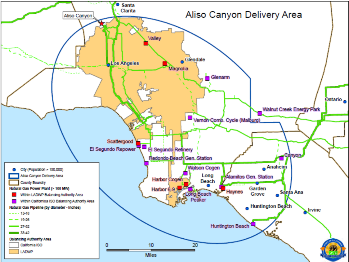
Figure 2: Electric Generation Plants Served by Aliso Canyon