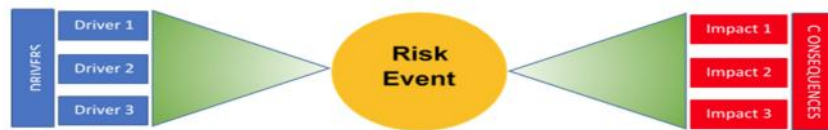
Figure 1 Sempra’s Risk Bow-Tie Diagram

Since there could be multiple outcomes for a risk event, the utility calculates a risk score across five impact dimensions (health/safety, reliability, environmental, compliance, financial) for each outcome without applying any weights across the impact dimensions. The total risk score for the risk event is calculated as the simple, non-weighted sum for all the different outcomes resulting from that failure event. Since the risk contribution from all five impact dimensions is summed without applying weights, each of the five impact dimensions is effectively given equal weight.