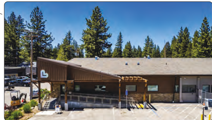
933 Eloise Avenue, South Lake Tahoe, CA 96150