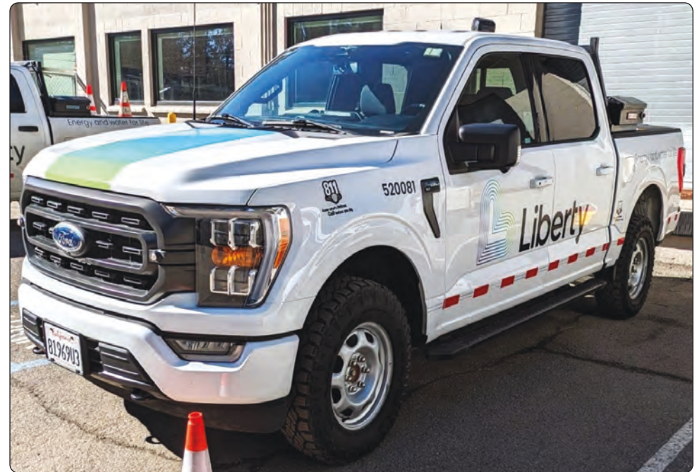
Elite Auto Network , Beverly Hills, CA, successfully delivered 12 vehicles and provided upfitting services as needed.