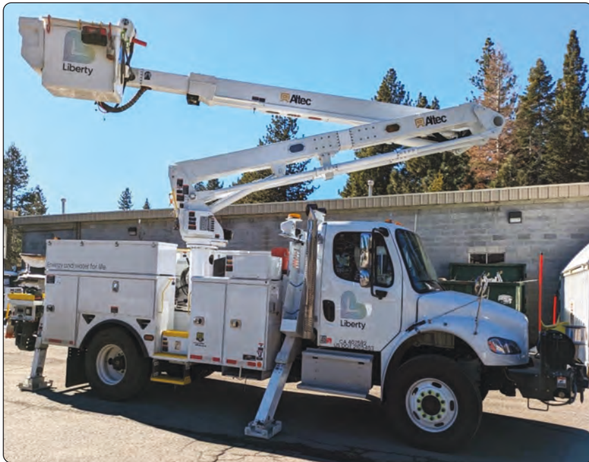
Altec TA60 – Bucket Truck- Delivered by SEC Auto Solutions , Dixon, CA.

Liberty continued expansion of its fleet utilizing two diverse suppliers. SEC Auto Solutions and Elite Auto Network provided a total of 13 new additions to Liberty's fleet of service vehicles. This is the second-year relationship with both suppliers, and they have performed well and met expectations to provide safe and equipment-ready vehicles. The fleet services they have provided allowed Liberty's operations team to deliver reliable and safe electric service to customers throughout the Lake Tahoe Basin.