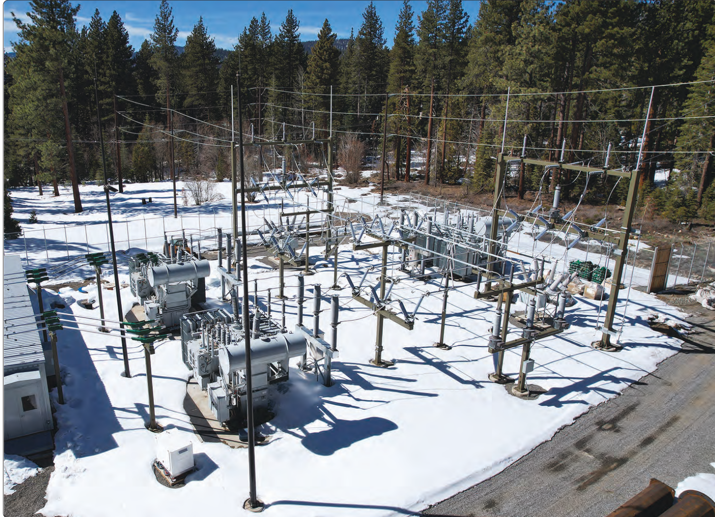
A Liberty Utilities CalPECO Lake Tahoe Substation

Liberty Utilities CalPECO did not have Second Tier Subcontracting Spend for 2023.