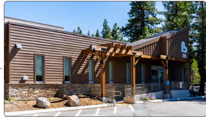
701 National Avenue, Tahoe Vista, CA 96148