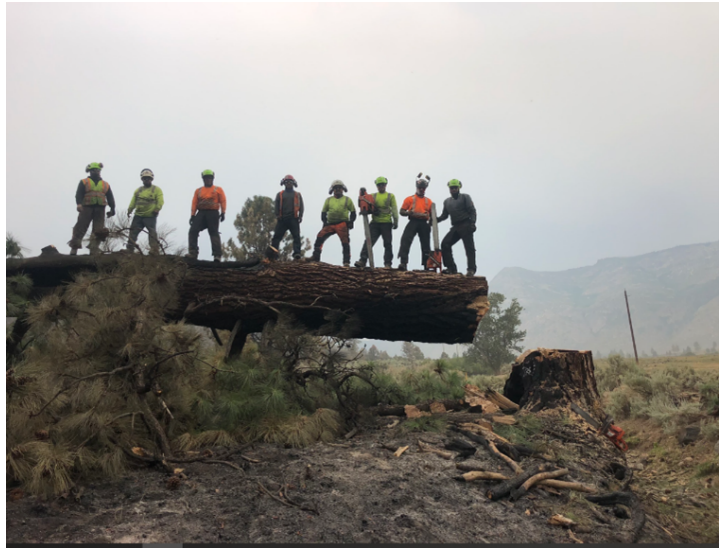
Work done by The Original Unlimited Tree Service Company