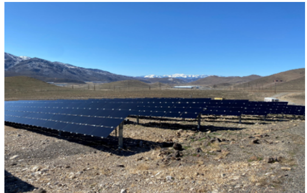
Luning and Turquoise Solar Panels