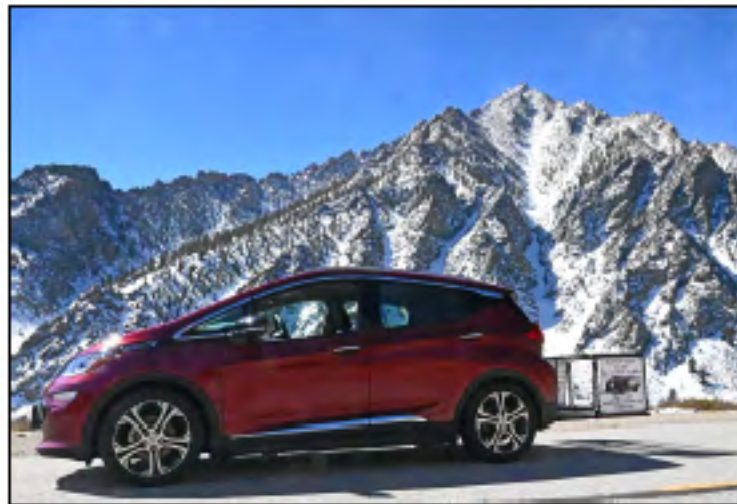
East Side Sierra Shuttle Chevy Bolt EV below Independence Peak

Your best value in trailhead rides. We take you where you want to go for less! We can take you anywhere in the Sierra Nevada or the Death Valley country.