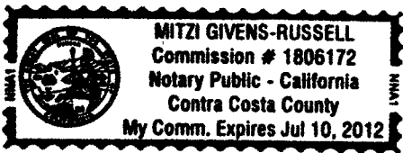
Place Notary Seal Above

Signature [Handwritten Signature] Signature of Notary Public